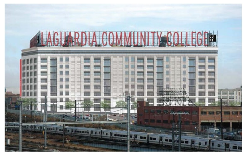
LaGuardia Community College Façade Replacement (rendering)